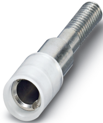
Female test connector, color: transparent

Please be informed that the data shown in this PDF Document is generated from our Online Catalog. Please find the complete data in the user's documentation. Our General Terms of Use for Downloads are valid ( http://phoenixcontact.com/download )